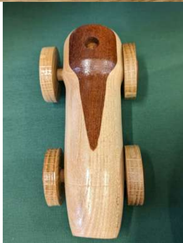
From Alan Wallington