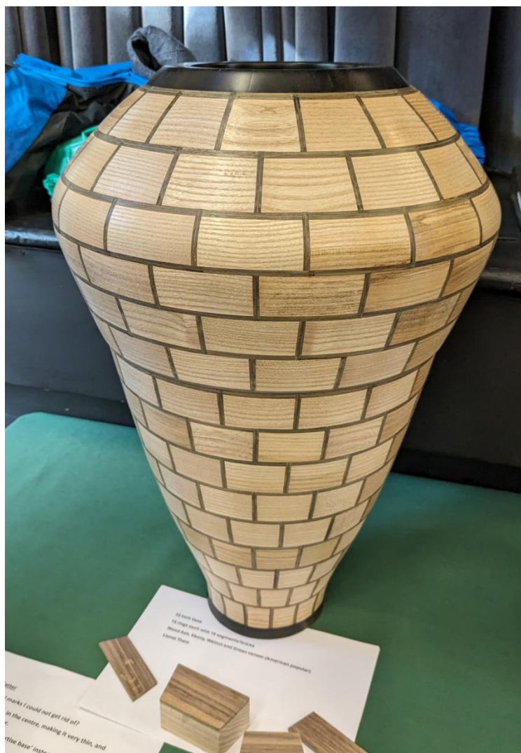
A segmented vase by Lionel Thain